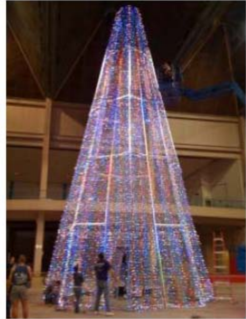
50 feet under construction!